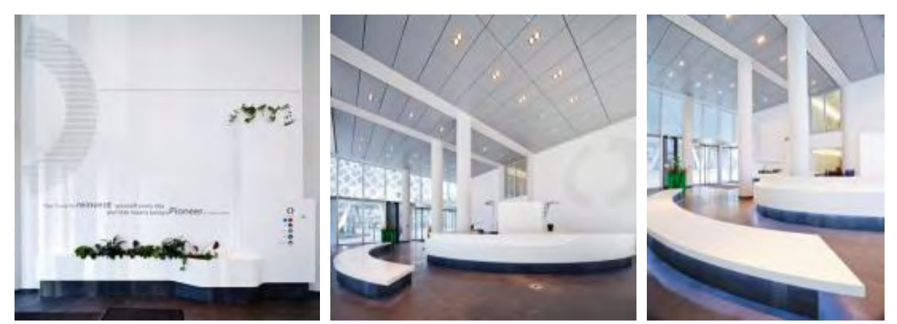
Petrom City, Bucharest, Romania, main building reception desk and area entirely made with round shaped DuPont<sup>™</sup> Corian<sup>®</sup> "organic skin"; photo Cosmin Dragomir, all rights reserved.

About Petrom (www.petrom.com) - With activities in the business segments of Exploration and Production, Refining, Marketing, Gas and Power, Petrom has proved oil and gas reserves of 854 mn boe, a maximum refining capacity of 8 million metric tons per year, approximately 540 filling stations in Romania and 270 filling stations in Moldova, Bulgaria and Serbia. In 2009, the turnover of the company was EUR 3,029 mn and EBITDA was EUR 696 million. After its privatization in 2004, the company recorded positive results. The modernization process initiated in 2005 is underway in accordance.